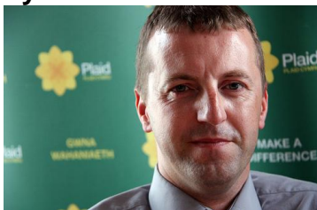
Plaid Cymru MP, Jonathan Edwards (pictured above)